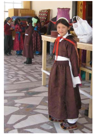
Far Right Ready to perform on Parents Day