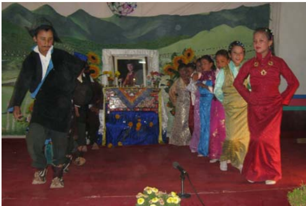
Far Left Students entertaining the guests during Parents Day, September