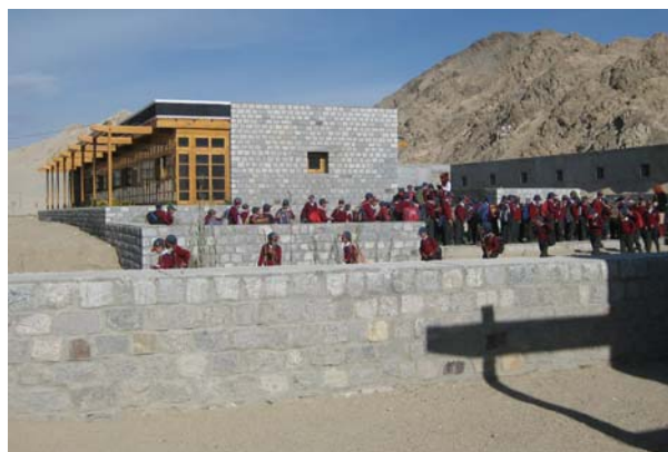
Near Left Residence 3 South was completed and is now occupied