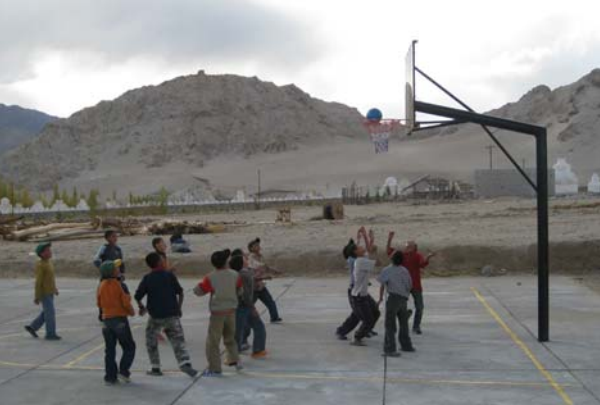
Near Left The new basketball court gets good use