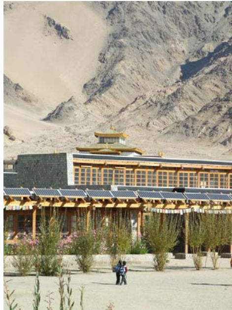
Far Left Arup Associates' design for a new library over the Central Courtyard, with solar panels on the roof. Fundraising is on-going.