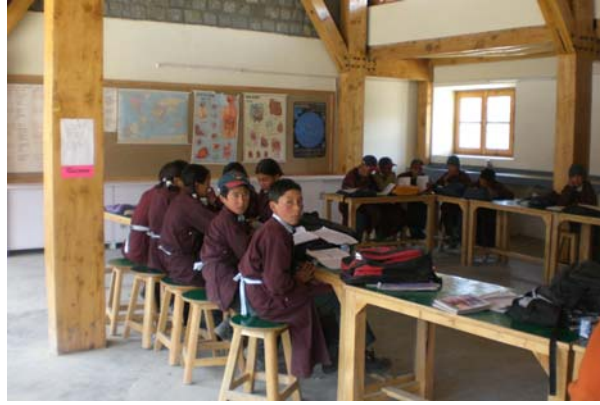
Near Left Students started using the first science laboratory in November