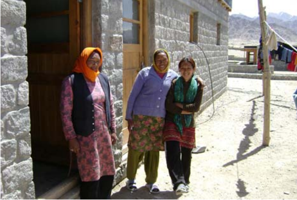
Near Left The indispensable wash-ladies outside the wash-house