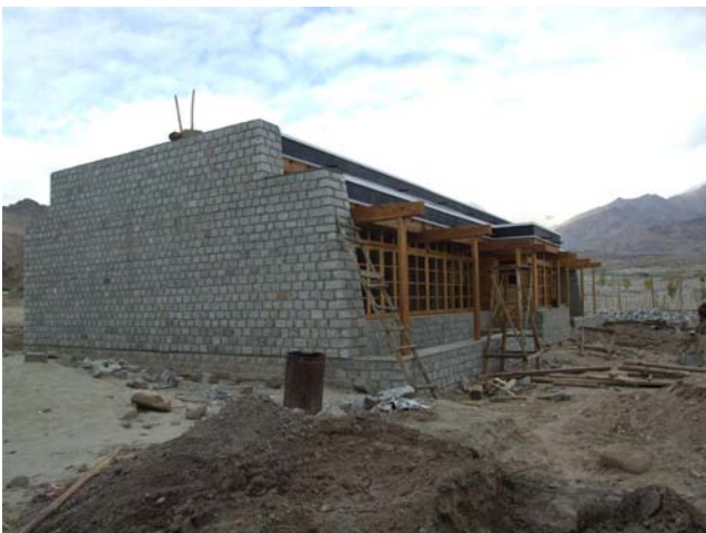
Below Construction of Residence 3 North started and the completed Residence is due to open early in 2009