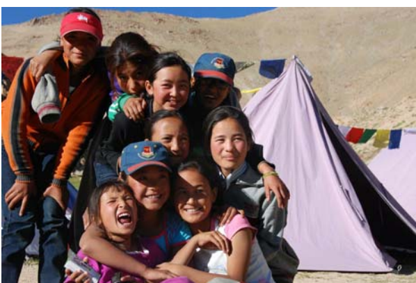
Far Left Girls and boys enjoying lunch in the Dining Hall